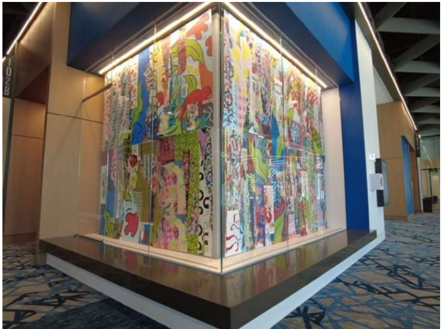
Exhibit design and display requirements will vary depending on the value, size, dimension, and composition of the items exhibited. All exhibit cases are glass-fronted, and provide lighting, security and a hanging system. There are limited podiums available upon request. Exhibition spaces are available in three basic sizes (39', 32', 23'), although dimensions vary slightly for each display case. Some cases are straight, while others wrap around corners (right).

MMG is committed to equity and inclusion in the artists and organizations supported through the development of public art. MMG is especially interested in applications from artists and organizations which have not recently received City public art projects. People of color, differently-abled persons, indigenous peoples, youth, LGBTQ+, seniors, and women are strongly encouraged to apply.