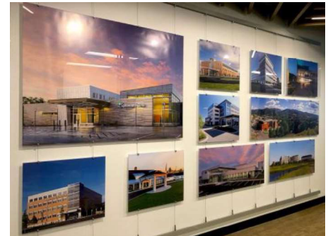
Example NovaDisplay system

Suspended glass shelves are available in three sizes: